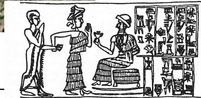
Inanna presents king Shu-Sin to Nannar/Sin