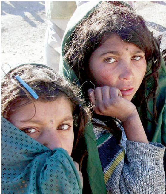
▲ Two Afghan girls quietly wait for food at a refugee camp on the Afghanistan-Iran border.